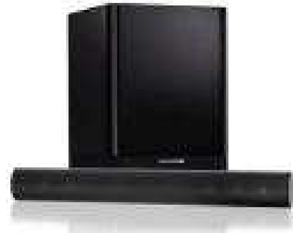
3D Front View